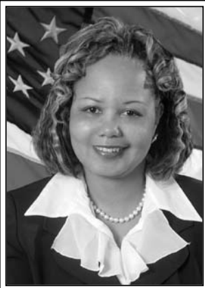
149 TH Judicial District Court Brazoria County Democrat

Business classifieds (offering a service or product line for profit) are $50, limit 40 words, please contact Peel, Inc. Sales Office at 512-263-9181 or advertising@PEELinc.com .