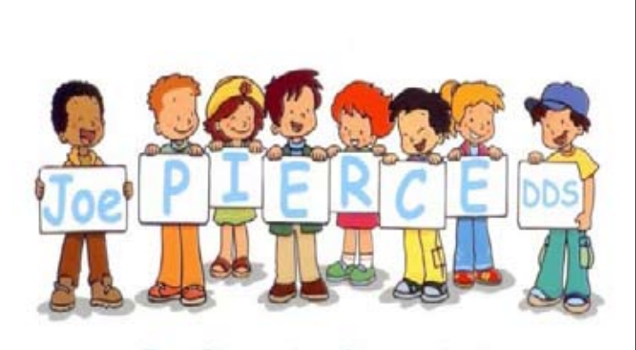
Pediatric Dentist infants children teens

13611 Skinner Road, Suite 135 Cypress, Texas 77429 (Skinner at Spring Cypress) www.cypresskidsdentist.com