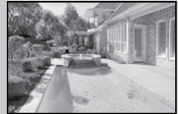
526 QUEENSBURY TURN $650,000