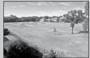
511 REGENCY CROSSING $550,000