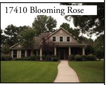
Lakes of Rosehill - 3/4 acre lot w/gorgeous estate home & 6+ car

I can customize a marketing plan to get your home sold, please call today!