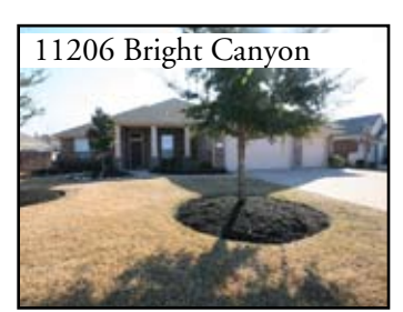
Cypress Creek Lakes - 1 story w/gameroom & 3-car garage