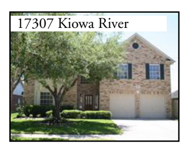
Riata Ranch - redone & done well, 3455 s.f. great price