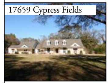
Cypress Fields - almost 10 rideable acres, pool, & estate home