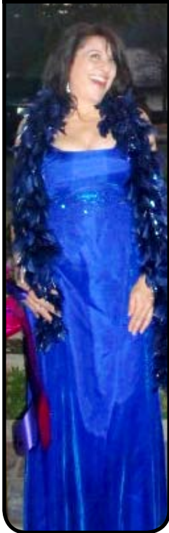
Jester Stars - (Continued from Page 2)