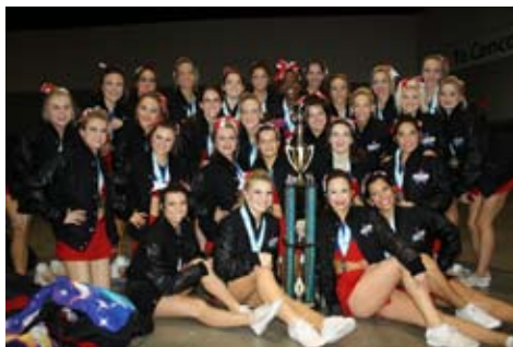
Tomball Cougar Cheerleaders

We would like to congratulate the Tomball Varsity Cheerleaders who competed in Georgia on February 19th and 20th. They brought home the big prize - their National Championship! Way to go, girls!