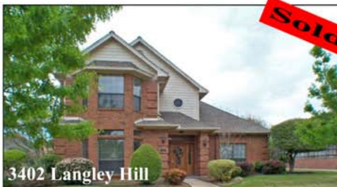
3402 Langley Hill