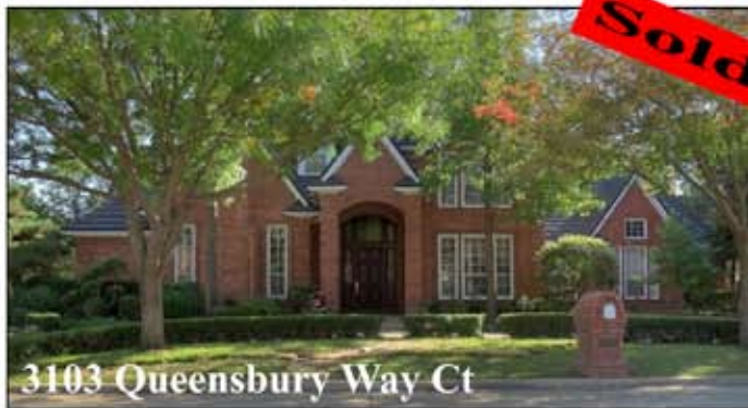
3103 Queensbury Way Ct