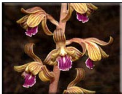
Spiked Crested Coralroot

Send your nature-related questions to naturewatch@austin.rr.com and we'll do our best to answer them. If you enjoy reading these articles, look for our book, NatureWatch Austin , to be published by Texas A&M University Press in September 2011.