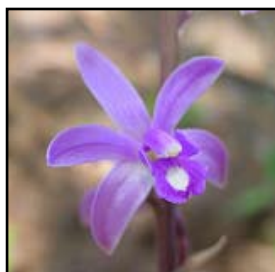
Giant or Largeflower Crested Coralroot

At no time will any source be allowed to use the Jester Estates Community Newsletter contents, or loan said contents, to others in anyway, shape or form, nor in any media, website, print, film, e-mail, electrostatic copy, fax, or etc. for the purpose of solicitation, commercial use, or any use for profit, political campaigns, or other self amplification, under penalty of law without written or expressed permission from the Jester Estates Homeowner's Association and Peel, Inc. The information in the newsletter is exclusively for the private use of Jester Estates residents only.