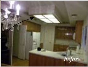
Removing the original lighting created a greater sense of height and space.