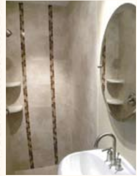
from powder room to full bath...