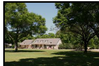
17659 Cypress Fields Cypress Fields under contract

Homes Under Contract - List With Us, We Sell Cypress!