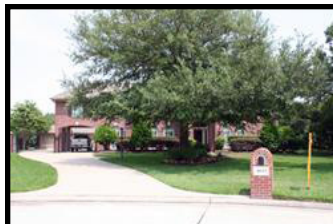
16022 Drifting Rose Lakes of Rosehill under contract in 2 weeks