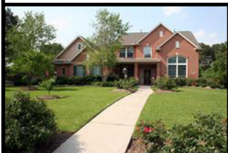
17410 Blooming Rose Lakes of Rosehill under contract

To get the best in Cypress, work with Cypress' best.