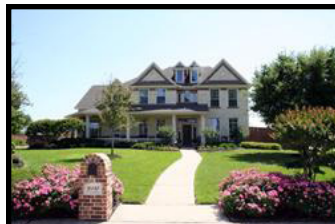
16610 Rose View Lakes of Rosehill under contract in 2 weeks