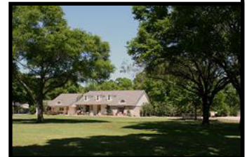
17659 Cypress Fields Cypress Fields under contract