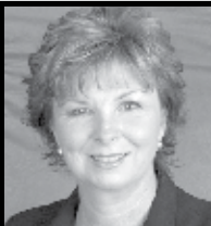
Your Cypress Specialist