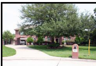
16022 Drifting Rose Lakes of Rosehill under contract in 2 weeks