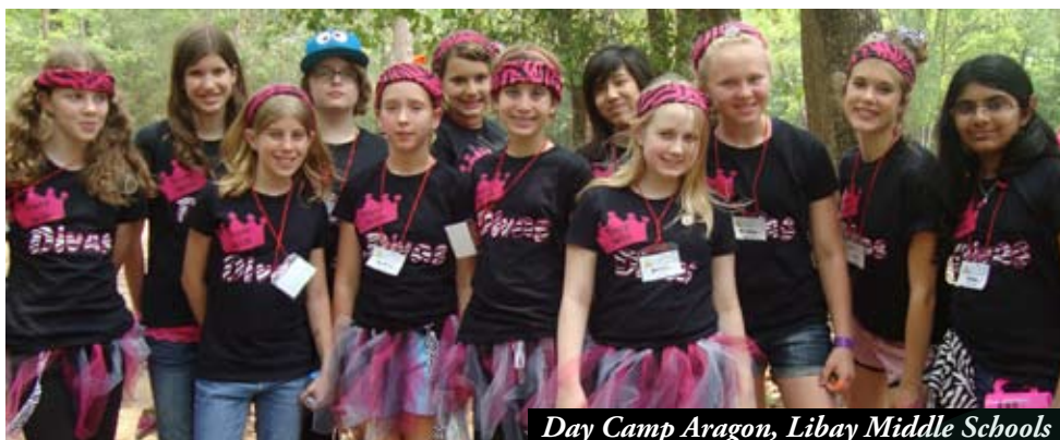
Day Camp Aragon, Libay Middle Schools