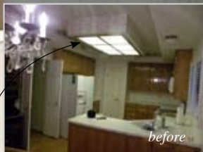
Removing the original lighting created a greater sense of height and space.