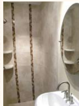
from powder room to full bath...