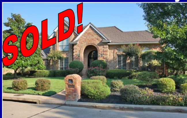
3410 Crossgate Circle S - $396,500