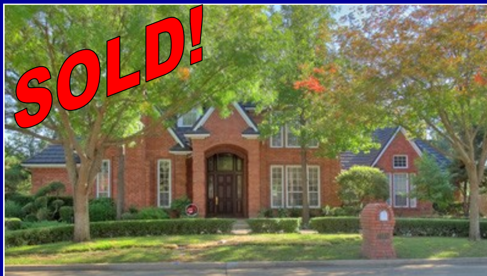
3103 Queensbury Way Court - $536,500

# 1 in $$ volume SOLD and # of Homes SOLD in Colleyville August 2011 Woodland Hills