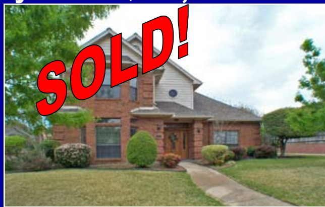
3402 Langley Hill Lane - $310,000