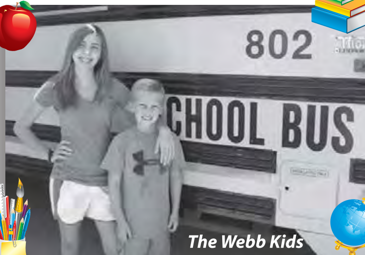
The Webb Kids