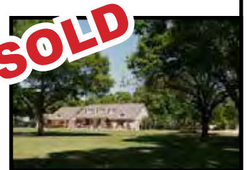
17659 Cypress Fields Cypress Fields under contract

Homes Under Contract - List With Me, I Sell Cypress!