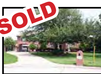
16022 Drifting Rose Lakes of Rosehill under contract in 2 weeks