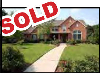
17410 Blooming Rose Lakes of Rosehill under contract

To get the best in Cypress, work with Cypress' best.