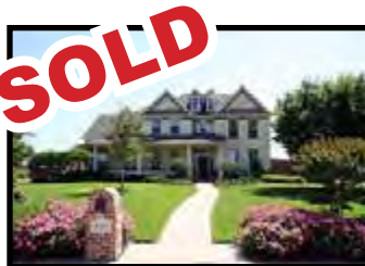
16610 Rose View Lakes of Rosehill under contract in 2 weeks