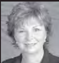
Your Cypress Specialist

Homes Under Contract - List With Me, I Sell Cypress!