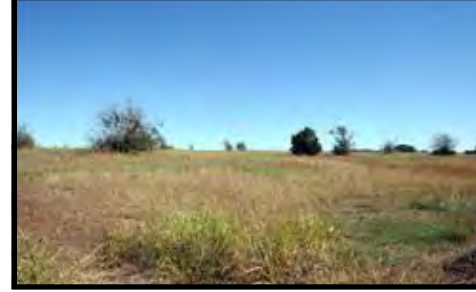
Build your dream home on the hill! 38.6 acres in Industry with well So pretty!