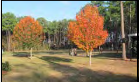
- Private approx 5 treed acres with barn & stable Gorgeous home in Waller County