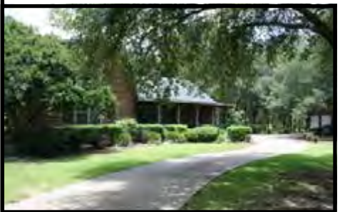
17303 Shaw Rd. 12 Beautiful Acres with a Log Home Perfect for Wedding/Ladies Retreat Venue (under contract-call for more info)