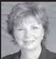
Your Cypress Specialist