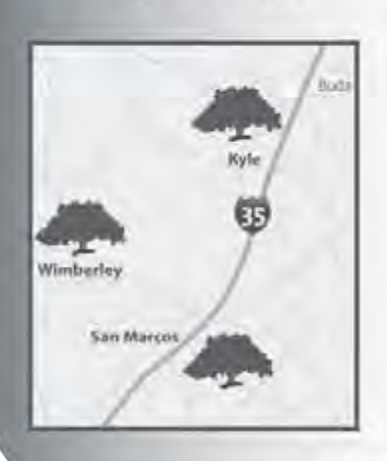
Live Oak HEALTH PARTNERS PRIMARY & SPECIALTY CARE