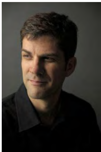
Best-selling author Jeff Abbott

Popular cultural education program features nationally-acclaimed Austin author