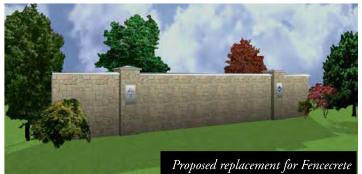
Proposed replacement for Fencecrete

The Board is not recommending the clubhouse at this time and is recommending replacement of the Fencecrete because of the long term value of this proposal, paying for it using existing reserves and one of the phased completion schedules or a 5 year loan. (The 15 year loan has a high risk of increased costs for the 15 year adjustable loan.)