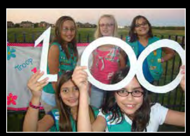
Brownies camp at Lone Star Yogi Camp ground located in Waller, TX. They earned 7 badges during their overnight experience.