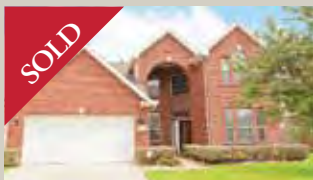
15219 Brown Eyed Susan