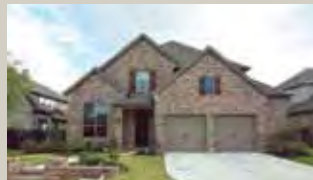
18419 Pin Oak Bend