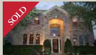
20918 Heartwood Oak