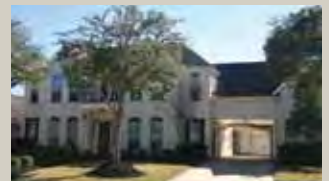
15615 Stable Oak