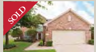
15318 Turning Tree Way