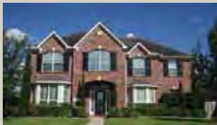
15922 Crooked Lake Way