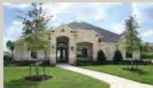
16510 Flaming Amber Way