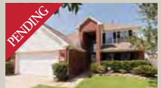
20518 Bouganvilla Blossom

Tour these homes and many more, 24 hours a day! www.ellisnaborsteam.com