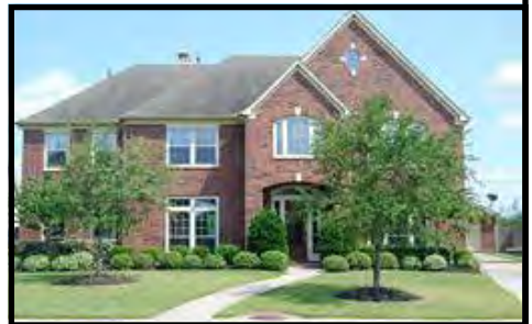
26035 Jodie Lynn Circle 5352 Beautiful Sq. Ft. with Pool Cypress Creek Lakes $482,000