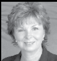
Your Cypress Specialist