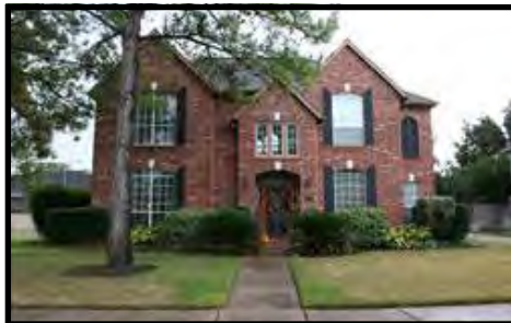
20803 Autumn Redwood Way Fairfield, 5 bdrm/4 bath with Pool This Home Has It All $239,900