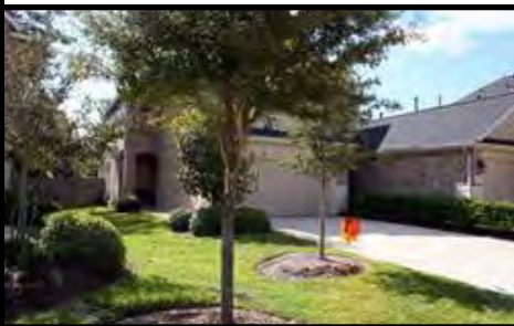
14558 Bergenia Coles Crossing Townhome with Pool Simply Gorgeous $168,500

Gorgeous Homes with Pools Ready for Quick Movein