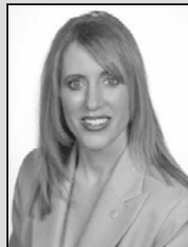
Eagle Springs Resident

Websites: majorleaguehomes.com prayingrealtors.com