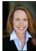
Jester Resident, Austinite Since 1977

Experience Austin's Leading Luxury Realtor, Turnquist Partners