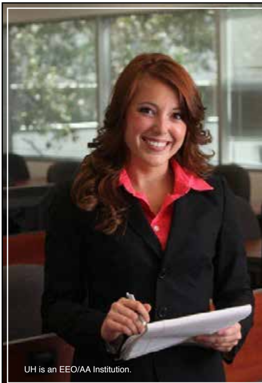
UH is an EEO/AA Institution.