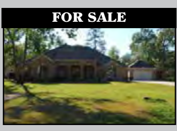
330 High Point Crossing