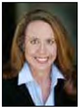
Jester Resident, Austinite Since 1977

Experience Austin's Leading Luxury Realtor, Turnquist Partners