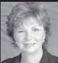
Your Cypress Specialist