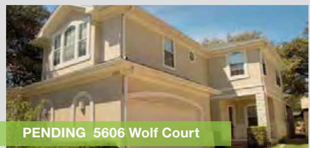
PENDING 5606 Wolf Court

3BD/2.5BA • $385,000 • Recently updated & move-in ready