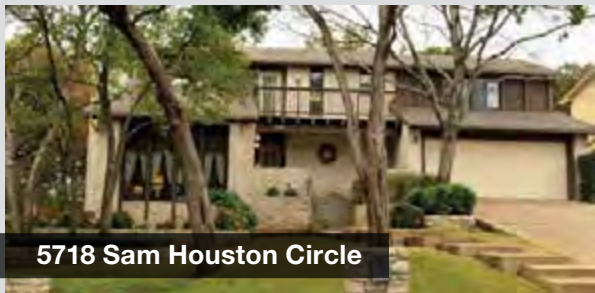
5718 Sam Houston Circle

4BD/2.5BA • $397,000 • Private Lake Austin access