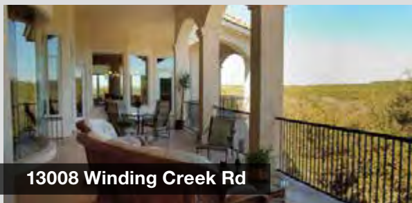
13008 Winding Creek Rd

3BD/2.5BA • $569,000 • Lake Austin views