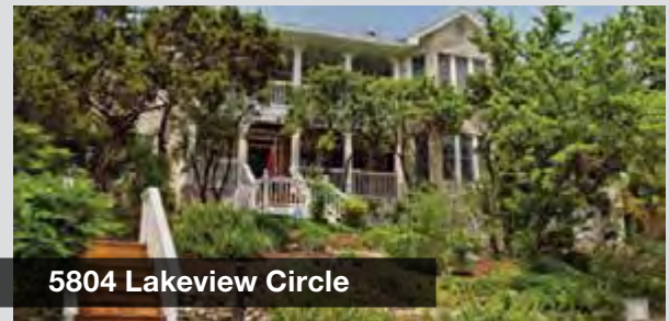
5804 Lakeview Circle

4BD/2.5BA • $397,000 • Private Lake Austin access