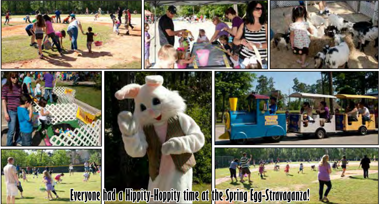
Everyone had a Hippity-Hoppity time at the Spring Egg-Stravaganza!