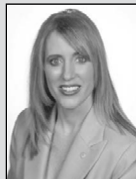
Eagle Springs Resident

Websites: majorleaguehomes.com prayingrealtors.com