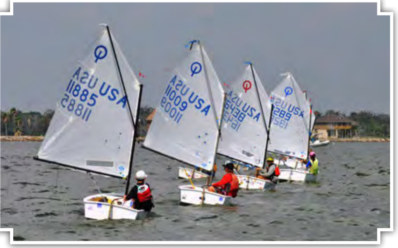
Optimists on the downwind run at the Endless Summer Regatta

Summer Solstice Regatta: Seabrook Sailing Club's annual Summer Solstice Regatta will be held on June