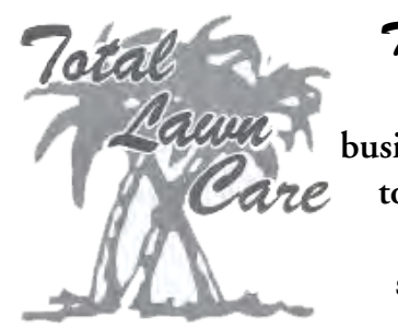
Total Lawn Care

is a family owned business that has provided top quality landscape and maintenance services since 1990.