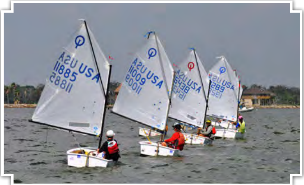
Optimists on the downwind run at the Endless Summer Regatta

Endless Summer Regatta: Each year, youth sailors from all over Texas and surrounding states participate in the Endless Summer Regatta at the Seabrook Sailing Club. The Endless Summer Regatta is the best attended event on the Texas Youth Circuit after Texas Race Week, with approximately