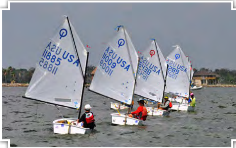
Optimists on the downwind run at the Endless Summer Regatta

Summer Solstice Regatta: Seabrook Sailing Club's annual Summer Solstice Regatta will be held on June 23 and 24, 2012. This year we will be kicking off the regatta on Friday night with fireworks and a keg! We encourage everybody to leave work early and bring a picnic. This regatta is open to all small sailboats and beginner racers are welcome. Lasers, 470's, Sunfish,