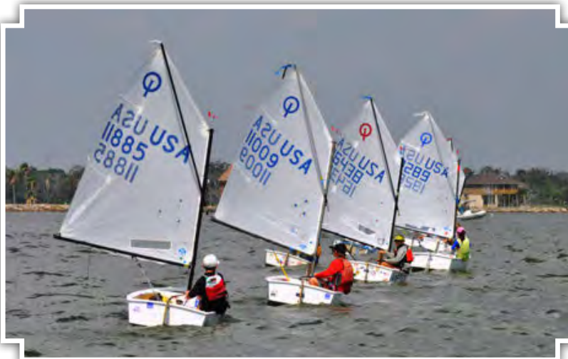
Optimists on the downwind run at the Endless Summer Regatta

Summer Solstice Regatta: Seabrook Sailing Club's annual Summer Solstice Regatta will be held on June 23 and 24, 2012. This year we will be kicking off the regatta on Friday night with fireworks and a keg! We encourage everybody to leave work early and bring a picnic. This regatta is open to all small sailboats and beginner racers are welcome. Lasers, 470's, Sunfish,