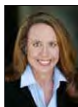
Jester Resident, Austinite Since 1977

* Under no circumstances shall the publisher be held liable for incidental or consequential damages, inconvenience, loss of business or services, or any other liabilities from failure to publish, or from failure to publish in a timely manner, except as limited to liabilities stated above.