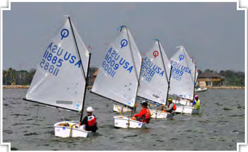
Optimists on the downwind run at the Endless Summer Regatta

Endless Summer Regatta: Each year, youth sailors from all over Texas and surrounding states participate in the Endless Summer Regatta at the Seabrook Sailing Club. The Endless Summer Regatta is the best attended event on the Texas Youth Circuit after Texas Race Week, with approximately