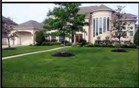
12411 Broken Pine Blackhorse Horse right on the golf course

Some of Cypress' Best with Pools Ready for Quick Movein