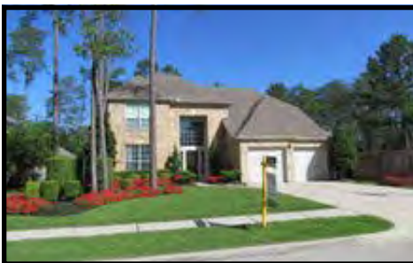
13418 Sterling Park Longwood, Trendmaker w/gorgeous pool.