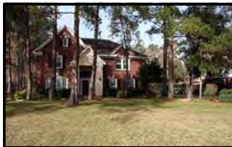
16003 Dove Trail Ct. Lakes of Rosehill big lot/low taxes - just beautiful