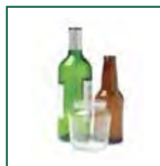
Glass Jars & Bottles (Clear, Brown, Green)