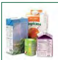
Juice Boxes & Milk Cartons

Rinse all containers thoroughly to keep recycling working!