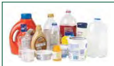
Plastic Codes (1, 2, 3, 4, 5, 7) RIGID Plastic Containers ONLY Free of all food and liquid