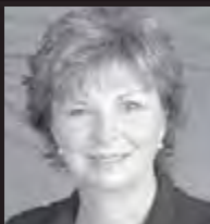
Your Cypress Specialist