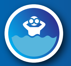
CONSTANT VISUAL SUPERVISION