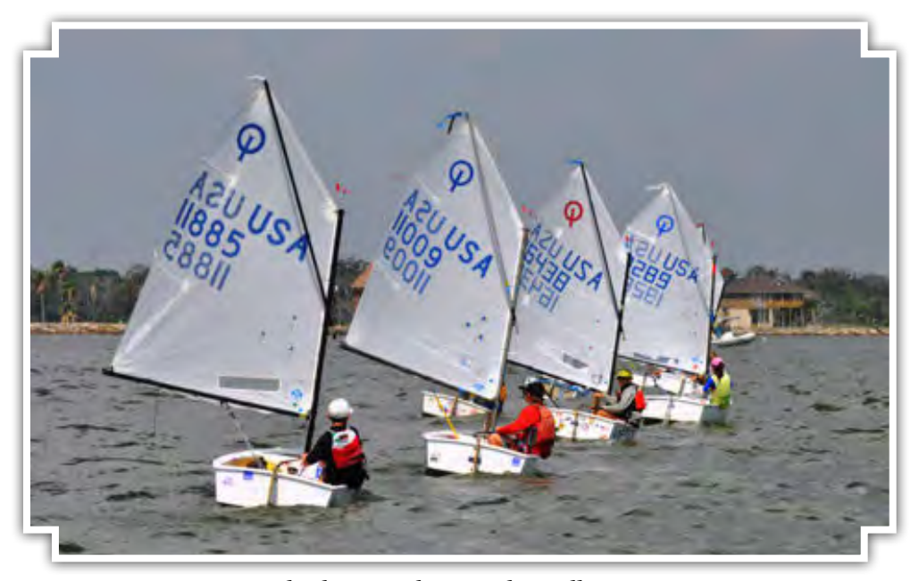
Optimists on the downwind run at the Endless Summer Regatta

Endless Summer Regatta: Each year, youth sailors from all over Texas and surrounding states participate in the Endless Summer Regatta at the Seabrook Sailing Club. The Endless Summer Regatta is the best attended event on the Texas Youth Circuit after Texas Race Week, with approximately