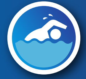
LEARN TO SWIM