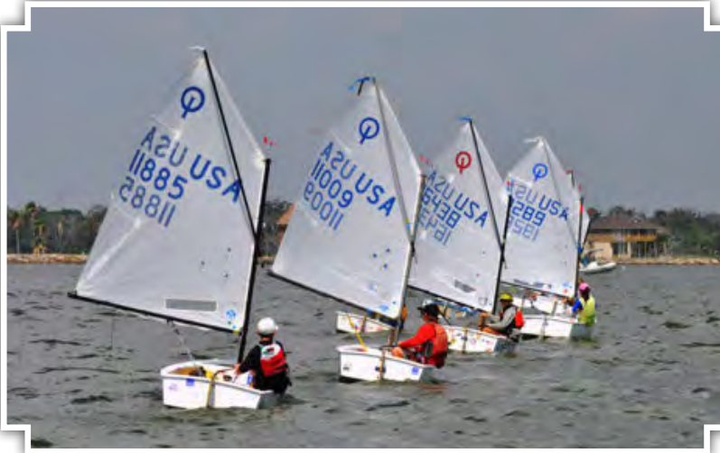
Optimists on the downwind run at the Endless Summer Regatta

Summer Solstice Regatta: Seabrook Sailing Club's annual Summer Solstice Regatta will be held on June 23 and 24, 2012. This year we will be kicking off the regatta on Friday night with fireworks and a keg! We encourage everybody to leave work early and bring a picnic. This regatta is open to all small sailboats and beginner racers are welcome. Lasers, 470's, Sunfish,