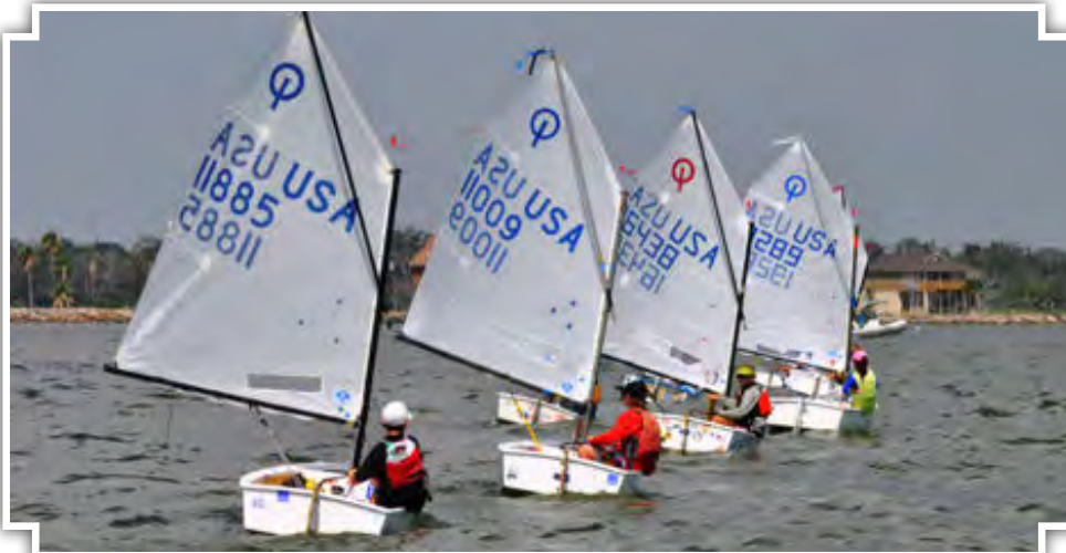
Optimists on the downwind run at the Endless Summer Regatta

The Seabrook Sailing Club is hosting two major regattas this summer on Galveston Bay, open to all interested sailors. Whether it's challenging one design racing or family fun, Seabrook Sailing Club's summer regatta schedule has it all. We are looking forward to having local and out-of-town sailors join us for competition and fun on the bay.