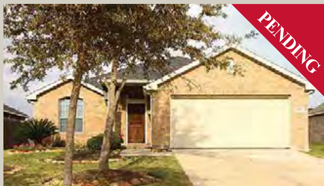
21822 Field Green Drive • $159,999