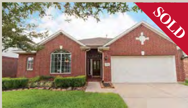
15338 Coral Leaf Trail • $159,900