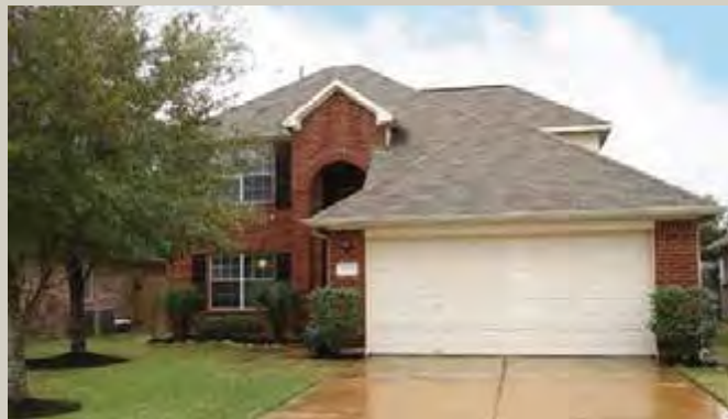
21915 Bronze Leaf Drive • $174,900