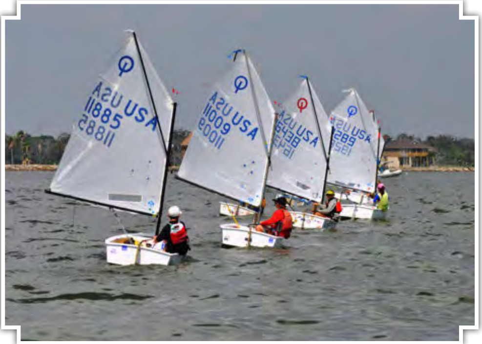
Optimists on the downwind run at the Endless Summer Regatta

Endless Summer Regatta: Each year, youth sailors from all over Texas and surrounding states participate in the Endless Summer Regatta at the Seabrook Sailing Club. The Endless Summer Regatta is the best attended event on the Texas Youth Circuit after Texas Race Week, with approximately 200 sailors, coaches, parents, and organizers coming to Seabrook and Galveston Bay. The youth sailors participate in 6 different fleets;