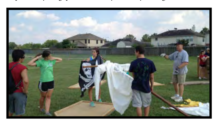
CWKC helping at Goodson MS's Field Day

300 Key Clubs! Over the year, Cy-Woods Key Club members were active and working hard by gaining an abundance of volunteer hours. Key Club is an organization that is immense all over the world (30 different countries) for people to help the community, gain leadership, and build your character to become less self-centered. Our Key Club is sponsored by the Cy-Fair Kiwanis, an organization where people of all ages help children everywhere around the world. Through Key Club, members help at various events such as school carnivals, orientations, sport games, church events, food banks and any event that requires help. Even though school has ended, Key Club remains active. If you require help with anything, please contact cywoodskeyclub@gmail.com.