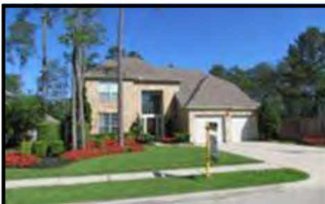
13418 Sterling Park

Coles Crossing, 5 / 4 1/2 / 3 car & pool w/great cds location backs to nature trail