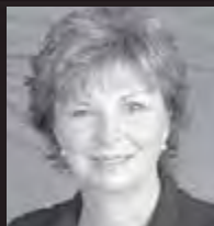
Your Cypress Specialist

Lakes of Rosehill; beautiful 3/4+ acre yard 4 / 3 1/2 / 3 car & 3 living areas; 3312 sq. ft.