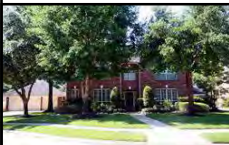
16611 Hope Farm

To get the best in Cypress, work with Cypress' best.