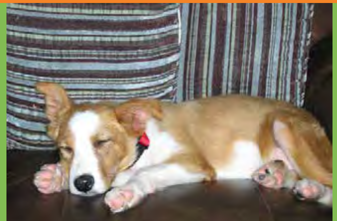
AND WHO DOESN'T LOVE A GOOD PUPPY PHOTO! THIS IS PUPPY KIRBY TAKING A NAP. (HE'S BEEN ADOPTED)