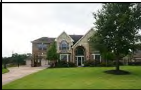
17615 Black Rose Trail take note-this 7 car garage comes w/a gorgeous home $459,600 so pretty