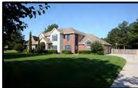
15813 Rosethorn Ct. Lakes of Rosehill; beautiful 3/4+ acre yard 4 / 3 1/2 / 3 car & 3 living areas; 3312 sq. ft.