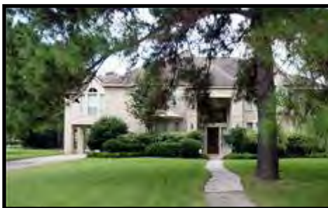
15903 Drifting Rose 5 bdrm beautiful Trendmaker w/pool & lake view $424,900