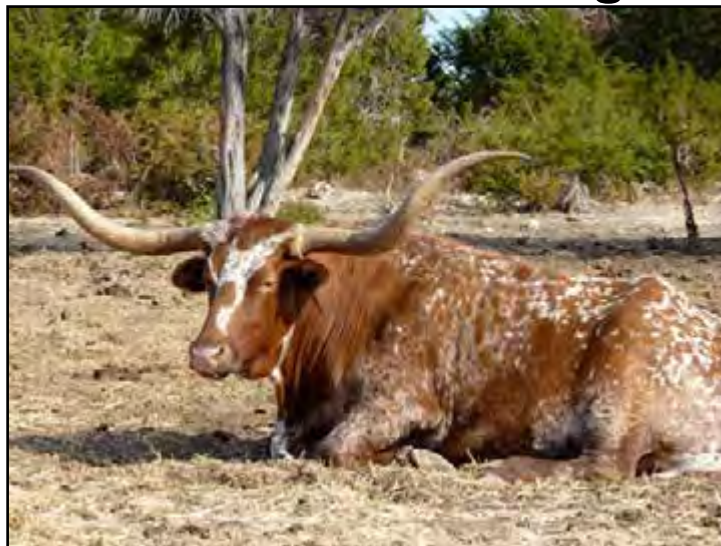
"Buck" Mitchum, age 15, has a horn span of 7 feet and is a cousin of Bevo XIII.