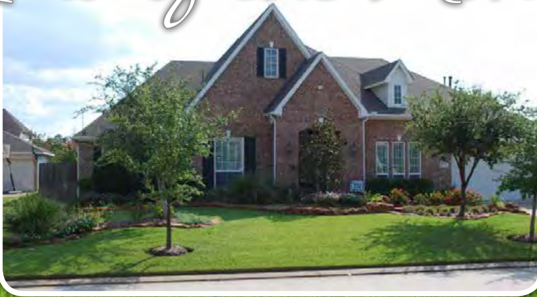
12619 Wandering Streams